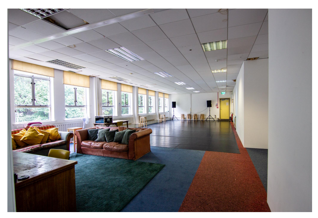
Image description: A large room with white walls and windows, with two sofas, stools, a green rug, a long brown desk, black dance floor and two speakers.