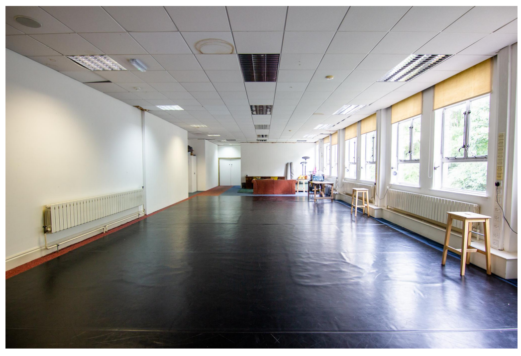
Image description: A large room with white walls and windows, with a black dance floor, stools, sofas, a metal cupboard and double doors.